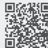
See how MAGAPAL® works on video