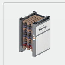
Stainless Steel Version